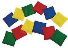
3.5 square bean bags (2 per pack)