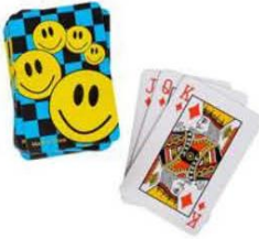
mini-deck of cards (1)