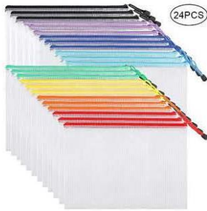
A4 Pencil Zippered Pouch Mesh (1)