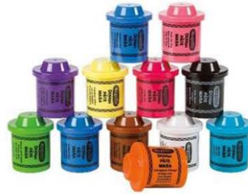
2 oz Dough – Any Brand (1) (discount school supply has a great generic one or Crayola brand on Amazon)