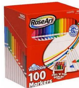
Washable markers (2 per pack)