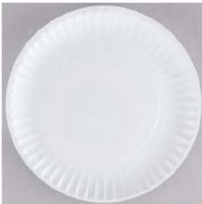
White paper plates 6 inch (12 per pack)