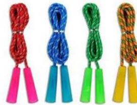
Children's jump rope (1)