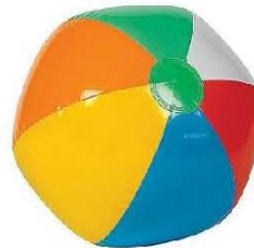
5-inch beach ball (1)