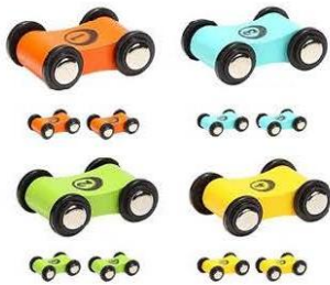
Wooden track cars (2 per pack) (can buy up to 5 sets at a time on Amazon)