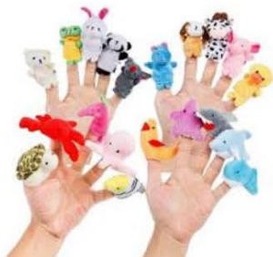
Animal finger puppets (2 per pack)

** Kits need to meet these specifications so that children can all receive an equal play kit. Please do not add or substitute items.