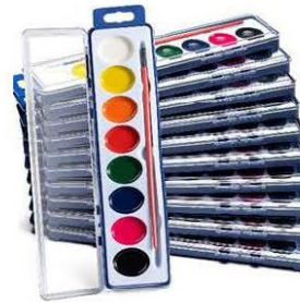
Watercolor paint set with brush (1)