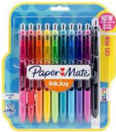
InkJoy Gel Pen (1)