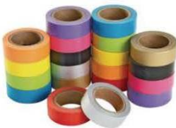
Washi Tape (3 rolls per pack)