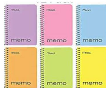
3 x 5 notebook (1)