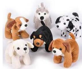
Small Plush Dog – no larger than 5 inches