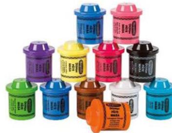
2 oz Dough – Any Brand (1) (discount school supply has a great generic one or Crayola brand on Amazon)