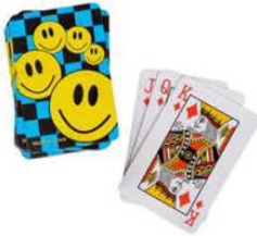
mini-deck of cards (1)