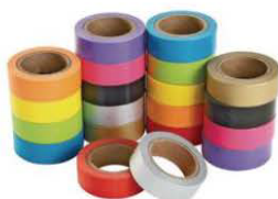
Washi Tape (3 rolls per pack)