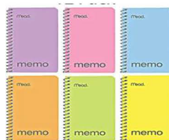
3 x 5 notebook (1)