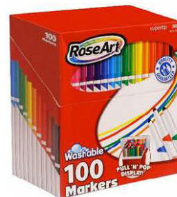
Washable markers (2 per pack)