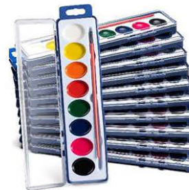
Watercolor paint set with brush (1)