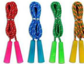
Children's jump rope (1)