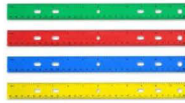
12 inch Rulers (2 per pack)