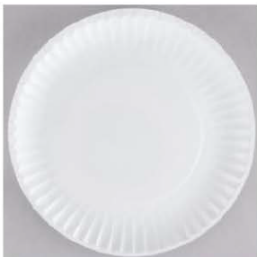
White paper plates 6 inch (12 per pack)