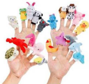
Animal finger puppets (2 per pack)

** Kits need to meet these specifications so that children can all receive an equal play kit. Please do not add or substitute items.