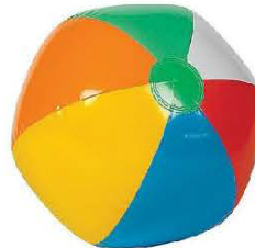
5-inch beach ball (1)