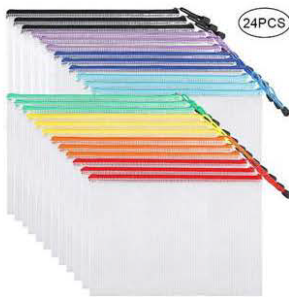
A4 Pencil Zippered Pouch Mesh (1)