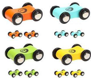
Wooden track cars (2 per pack) (can buy up to 5 sets at a time on Amazon)