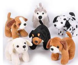
Small Plush Dog – no larger than 5 inches