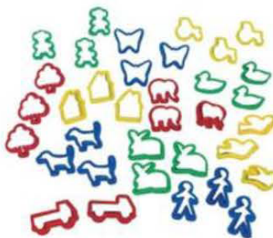
Clay cutter (1)