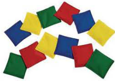
3.5 square bean bags (2 per pack)