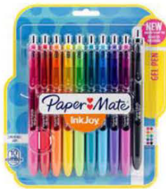
InkJoy Gel Pen (1)