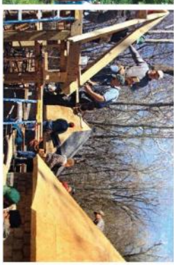
Sunday, September 29, 2019