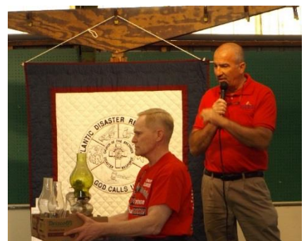
Church of the Brethren