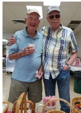
Just ate pie!