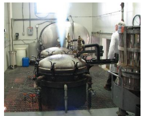
Baskets in the cooker