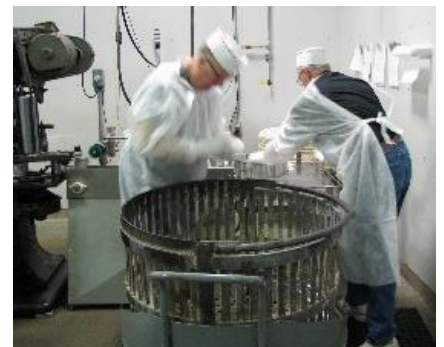
Wiping and putting cans in baskets

Mid-Atlantic churches donated $16,542.52