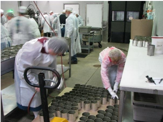
Prepping the cans

Meat Canning Project 2018 – Mid-Atlantic and Southern PA Districts from 2016