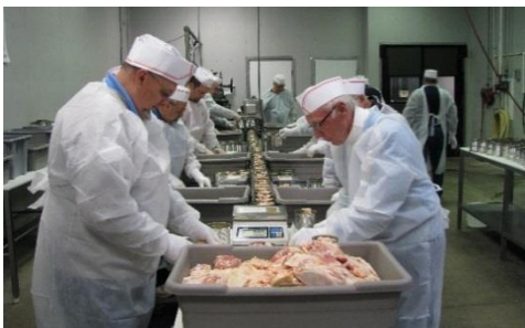
Packed chicken can line

200 cases to Honduras ● 200 cases to Cuba