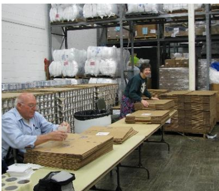
Putting labels on boxes

Mid-Atlantic churches donated $16,542.52