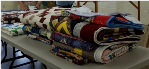
105 quilted items

White Elephant Table • Baskets • Crafts • Share-A-Meal • Outside Auction