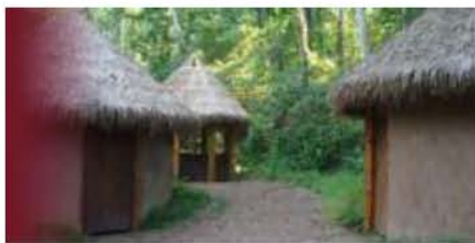
Mozambique dwellings at the Heifer Global Village

This is a 4-person team, captain's choice, scramble event, with prizes awarded in multiple flights, for closest to the pin, and long drives. Mulligan/powerball packages will be available for a donation on tournament day. $5,000 will be awarded for any hole-in-one on hole # 17.